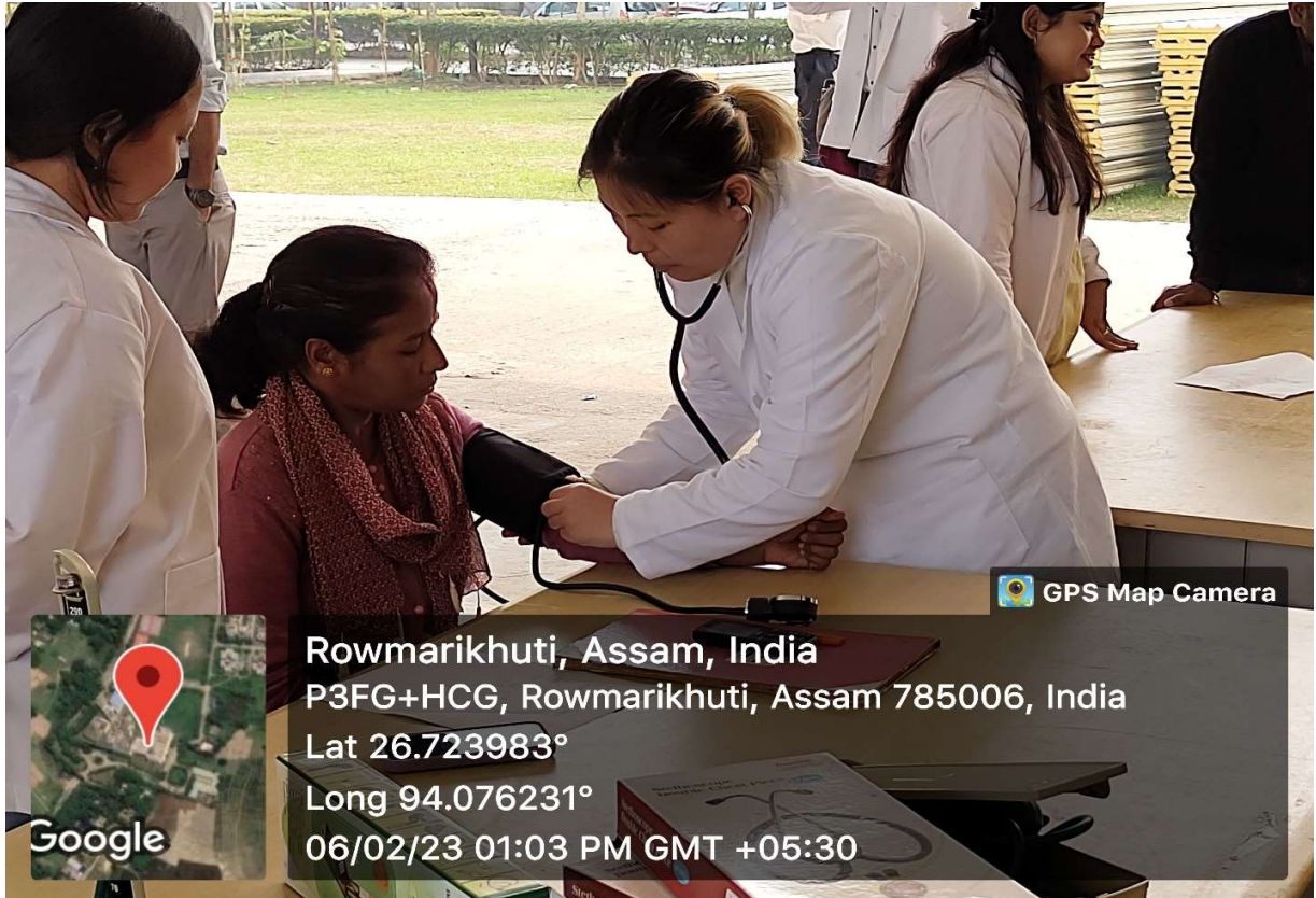
Fig.7 Health Check -Up