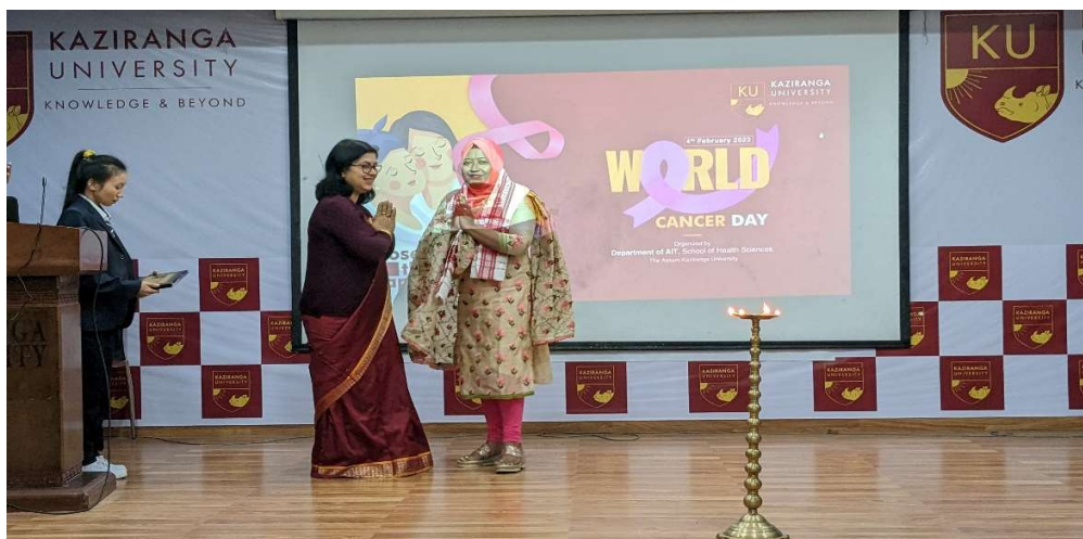
Fig.2 Felicitation of Guest