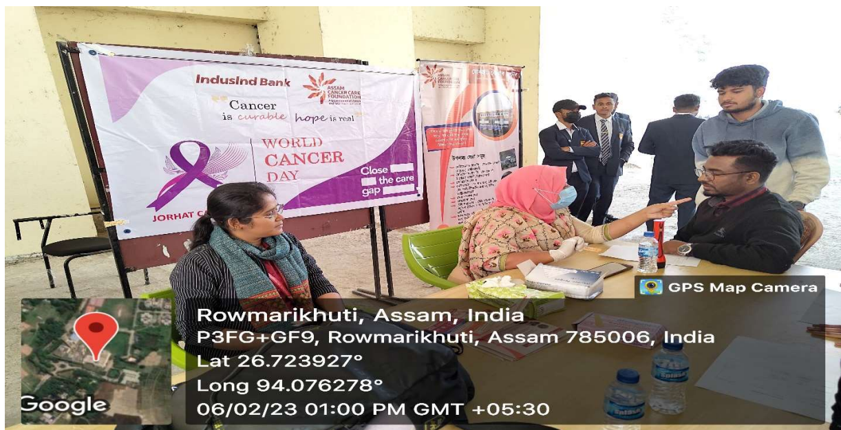
Fig.4 Health Screening Camp