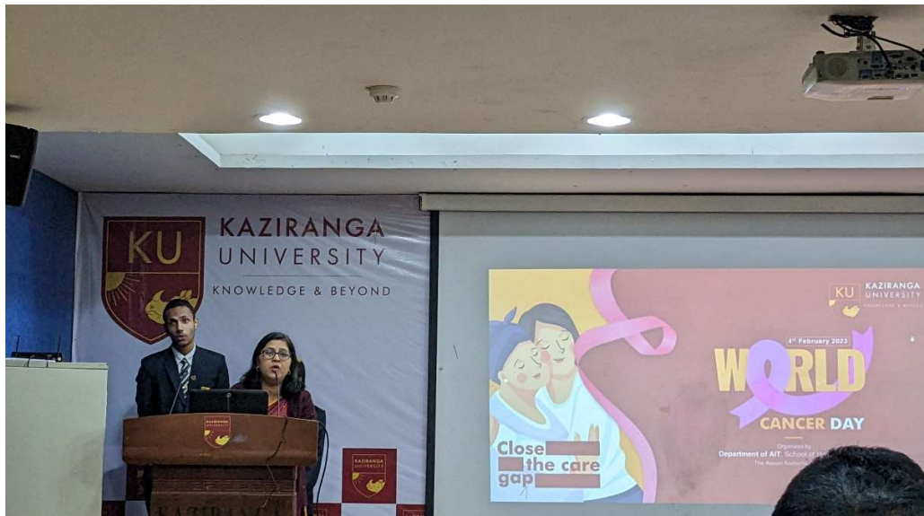
Fig.3 Speech by Dean, SHS