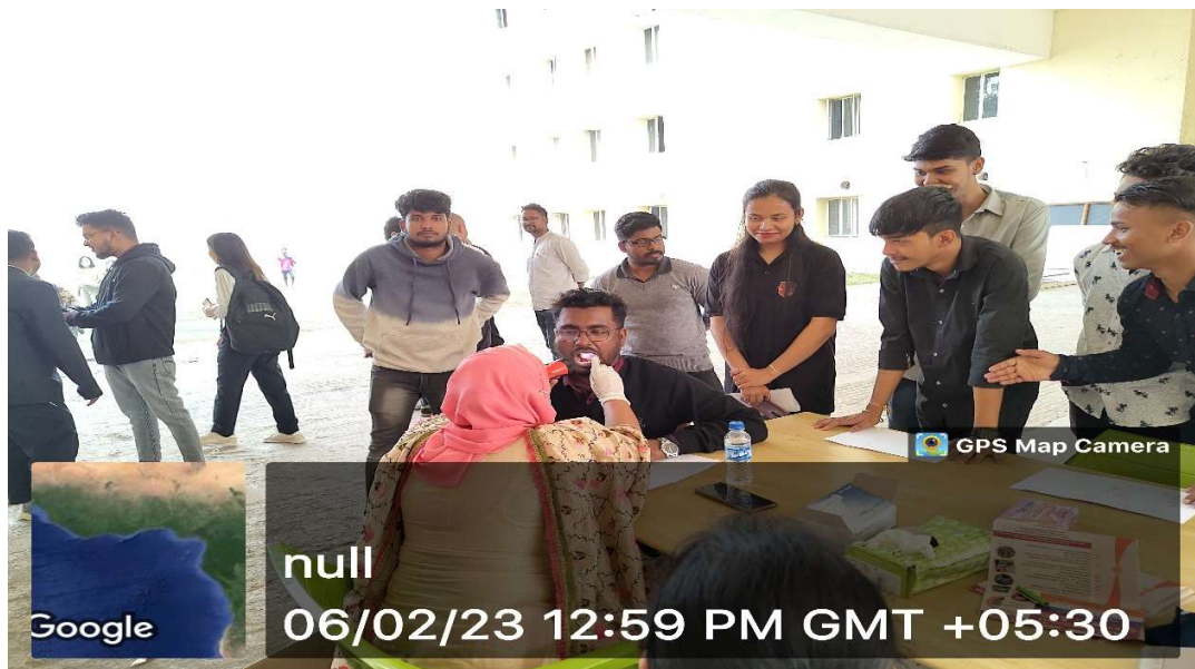
Fig.5 Cancer Screening