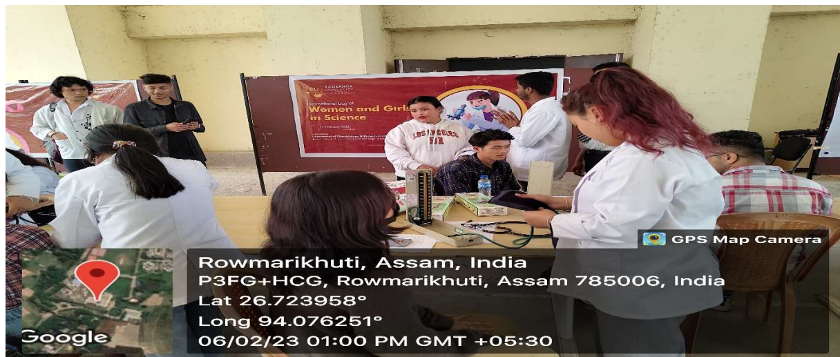
Fig.6 Checking of Blood Pressure