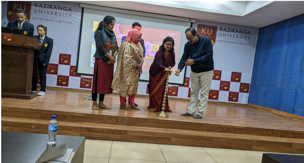
Fig.1 Lightening of Lamp by Guests/V.C Sir/Dean, SHS